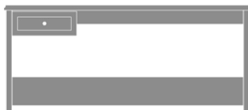
LADK103L 69W 19.5D 30H