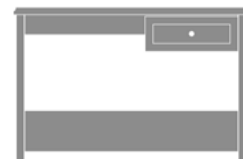
LADK102R 45.25W 19.5D 30H