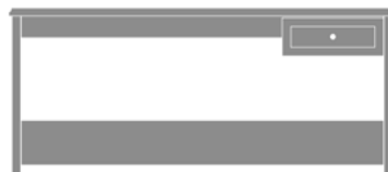
LADK103R 69W 19.5D 30H