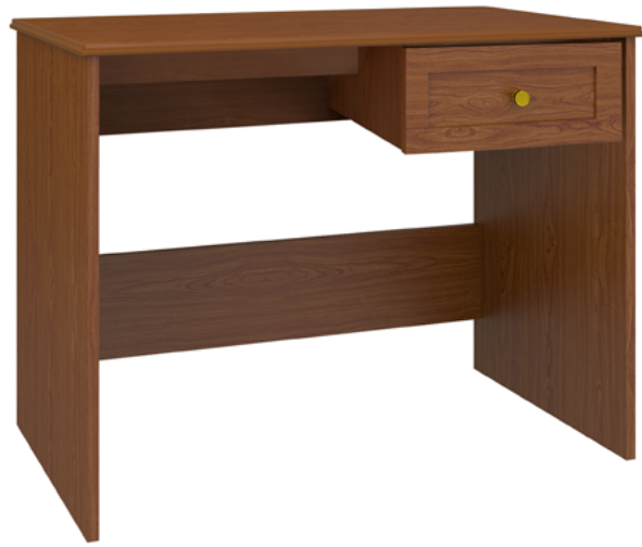
Model: LADK101R 40.5W 19.5D 30H

The Lancaster Collection offers unobtrusive refinement and skilled craftsmanship to form the perfect balance between function and beauty. Rich OG detailing on the tops and recessed insert panels set into chamfered frames on doors and drawers. Collection available with or without contrasting edges as well as custom color combinations.